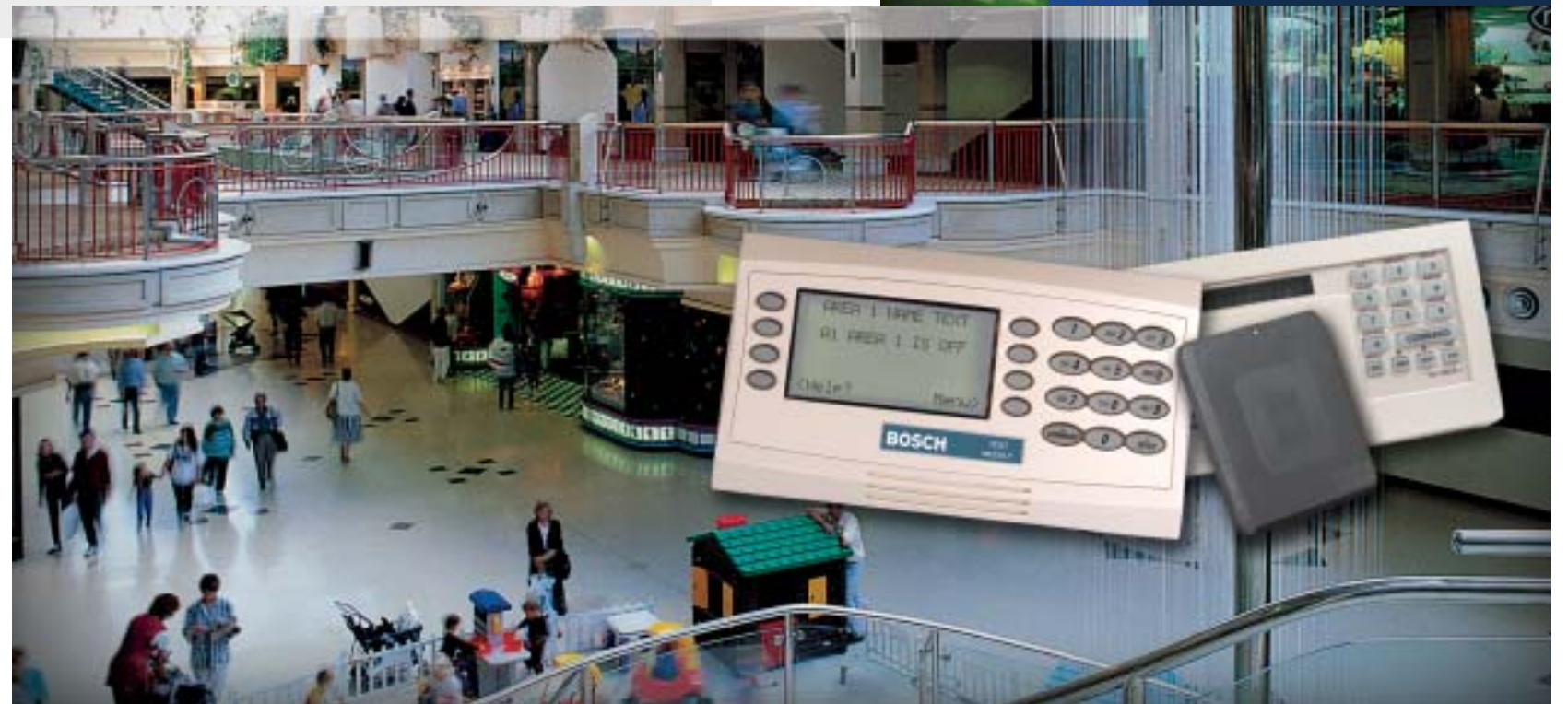
Commercial application and product information